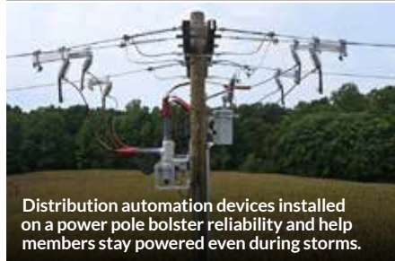
Distribution automation devices installed on a power pole bolster reliability and help members stay powered even during storms.