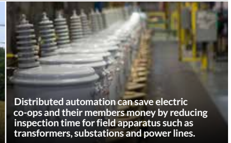
Distributed automation can save electric co-ops and their members money by reducing inspection time for field apparatus such as transformers, substations and power lines.

DA not only has a hand in preventing outages, but this suite of technologies can save electric co-ops and their members money by reducing inspection time for field apparatuses such as transformers, substations and power lines.